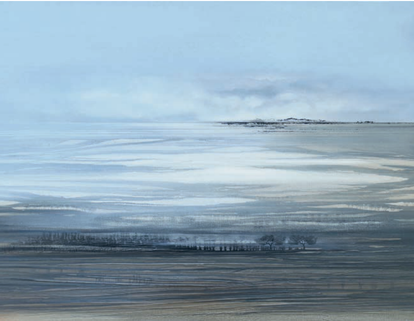
“Vieux couple”, 97x130 cm, oil/canvas

By following different byways, he imagines new horizons, seeking to generate an emotion, to grasp what the world has lost: its origins .