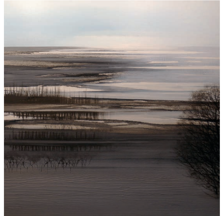
“Contre jour”, 80x80 cm, oil/canvas

www.dhaudrecy-art-gallery.com · dhaudrecy@skynet.be