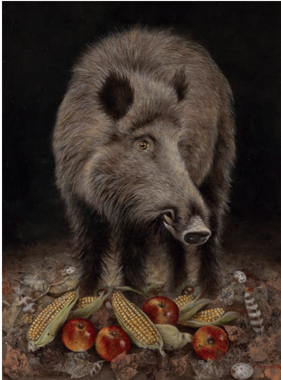
“Public Enemy No. 1”, oil on paper on canvas , 80x60cm