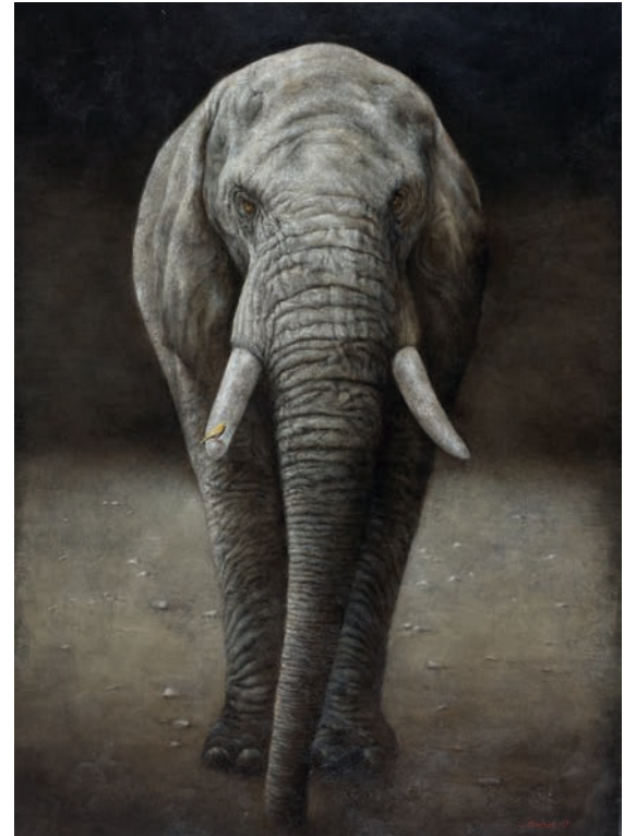
“Sentinel 1”, oil on paper on canvas , 139x100cm

www.dhaudrecy-art-gallery.com · dhaudrecy@skynet.be