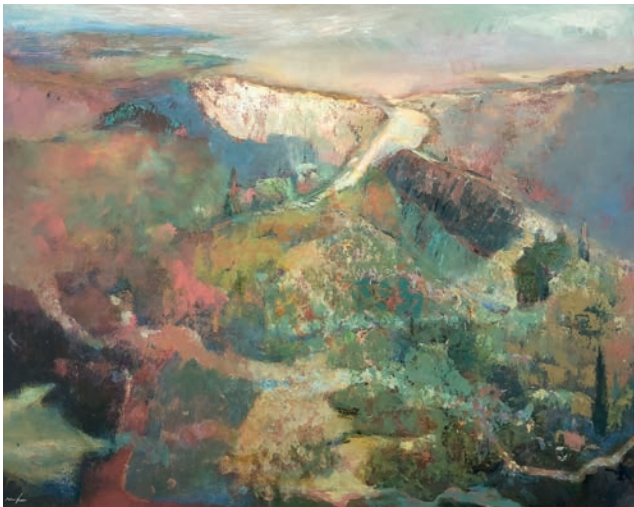
'Le Sentier du Lac', oil/canvas, 73x92cm