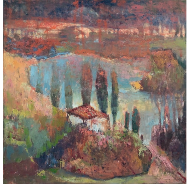
'Périgord Rouge', oil/canvas, 100x100cm

www.dhaudrecy-art-gallery.com · dhaudrecy@skynet.be